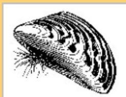
Illustration of a zebra mussel.

When removing boats, docks, lifts, or other water-related equipment from lakes and rivers, carefully inspect everything to make sure there are no aquatic invasive species (AIS) such as zebra mussels, Eurasian watermilfoil, or New Zealand mudsnails attached.