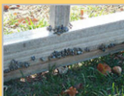
Zebra mussels found on a boat lift.

Look on the posts, wheels, and underwater support bars of docks and lifts, as well as any parts of boats, pontoons, and rafts that may have been submerged in water for an extended period. In newly infested waters, adult zebra mussels may not be abundant and you might notice only a few mussels on your equipment.