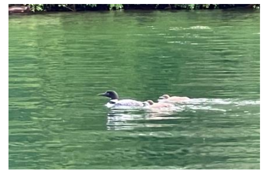
Photo of Loon and Chicks in spring

Lake Belle Taine Association P.O. Box 141 Nevis, MN 56467