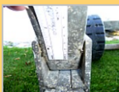
A hard-to-spot zebra mussel on a trailer.

Early detection for zebra mussels is important in protecting your property and Minnesota's water resources. Learn how you can become a volunteer zebra mussel monitor .