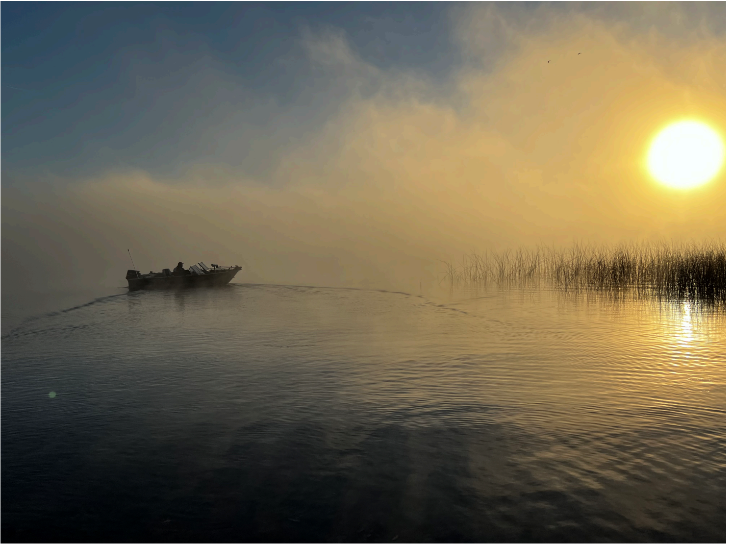
Fall Fishing – Taken 10/10 by Linda Fox