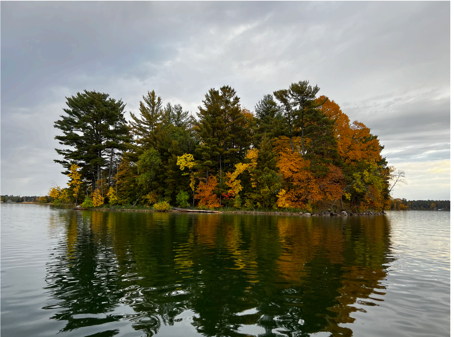
Fall Foliage – Taken 10/4 by Linda Fox